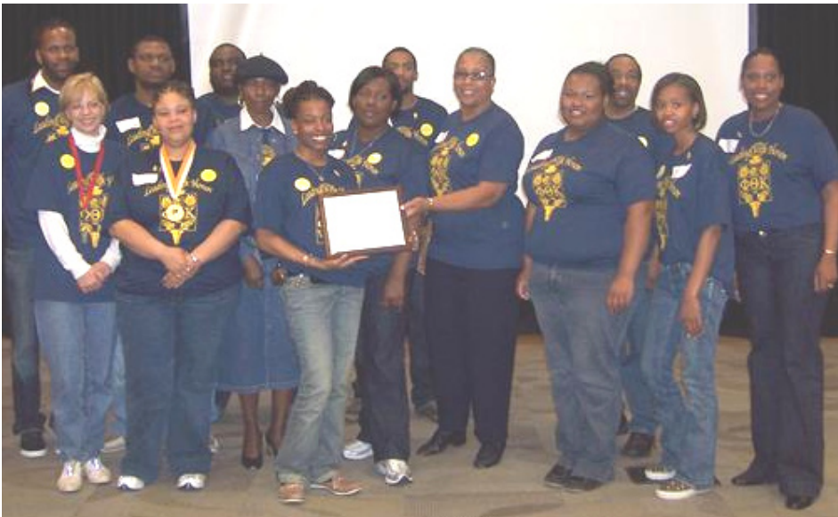
Beta Beta members accepting the award.