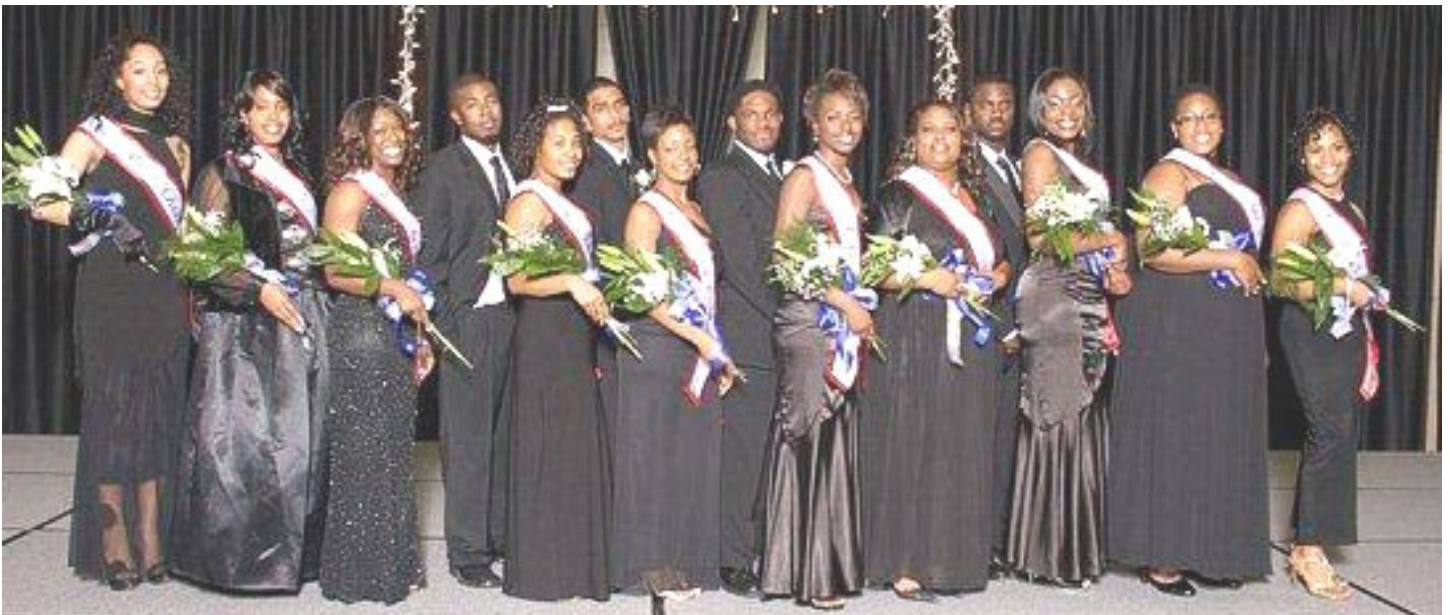
Clubs and Organizations Court Participants