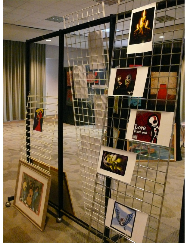
Collection of Various Artist